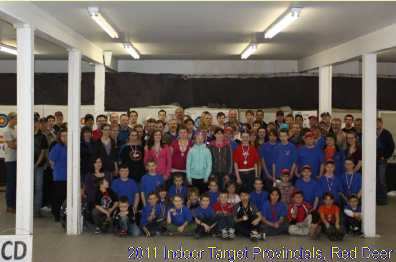
2011 Indoor Target Provincials, Red Deer